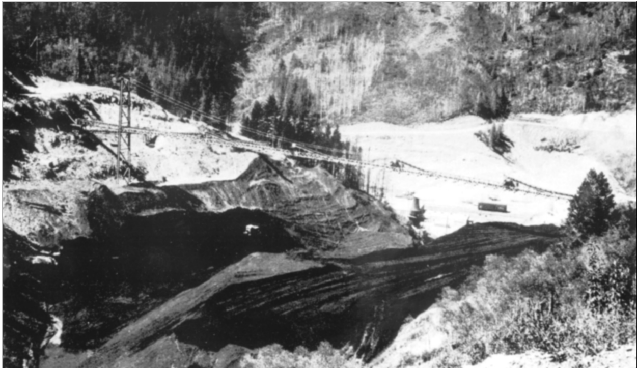
Figure 119. Cutting bridge at Central Farmers Fertilizer Company complex, date unknown.

the cutting bridge ( a devise, anchored at one end by the conveyor mechanism, and used to evenly stockpile the mined ore) was about 850 feet (Service, 1966).