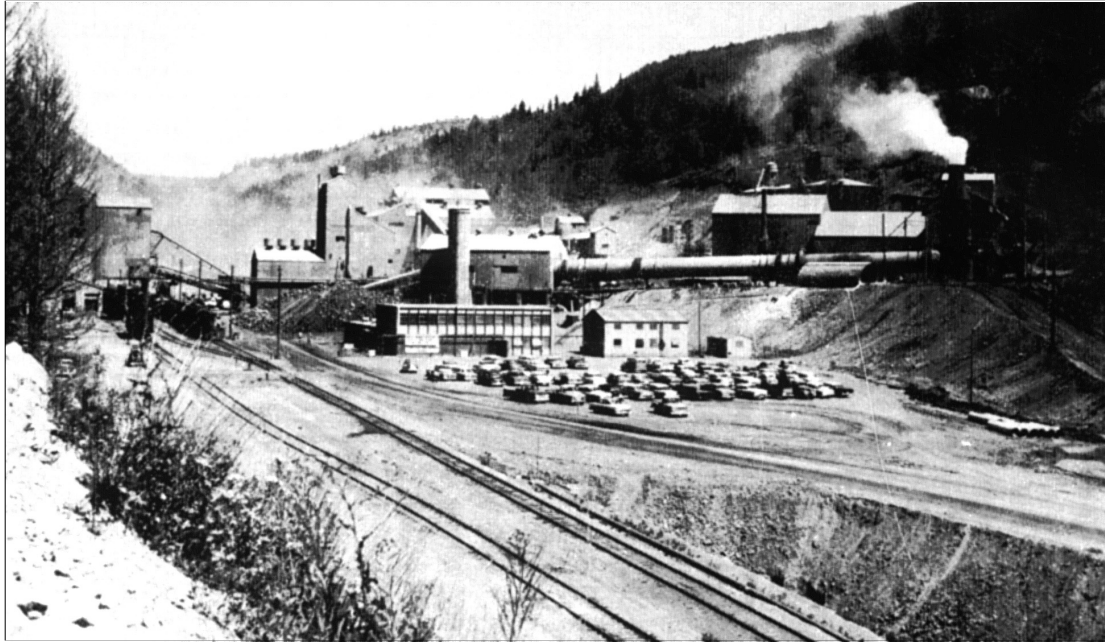
Figure 115. Central Farmers Fertilizer Company plant in Georgetown Canyon, date unknown.