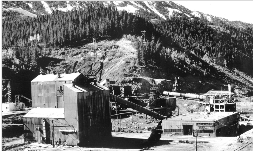
Figure 114. Georgetown Canyon phosphate plant of the Central Farmers Fertilizer Company, June, 1978.