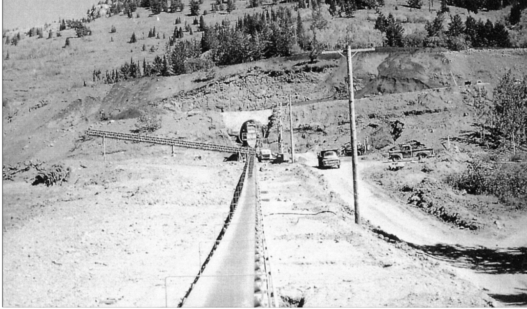
Figure 117. First ore starts down the conveyor belt at Central Farmers Fertilizer Company's Georgetown Canyon Mine, date unknown.