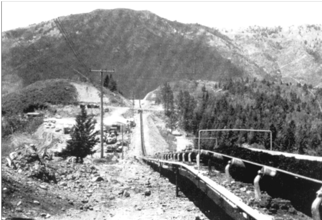
Figure 118. Conveyor belt at Georgetown Canyon Mine, date unknown.