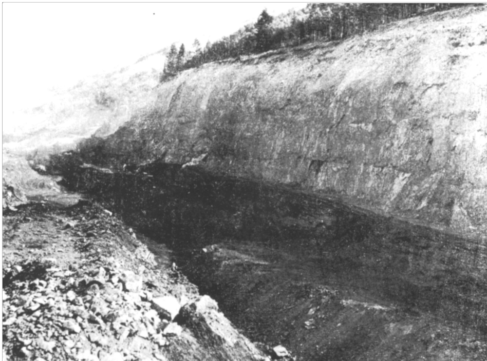
Figure 116. Georgetown Canyon Mine, date unknown.