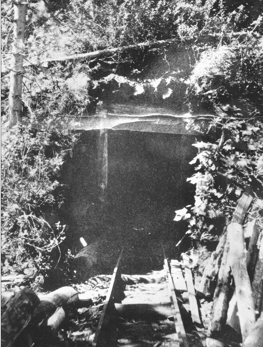
Figure 110. View of Tunnel Improvement No. 2, Superior Extension Claim, Georgetown Canyon Mine, October 3, 1916.

production oriented underground mining was ever accomplished by the UF&CMC on these patented placer claims.