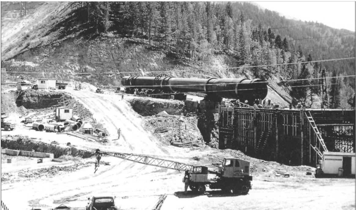
Figure 112. Kiln construction, Georgetown Canyon, 1957.