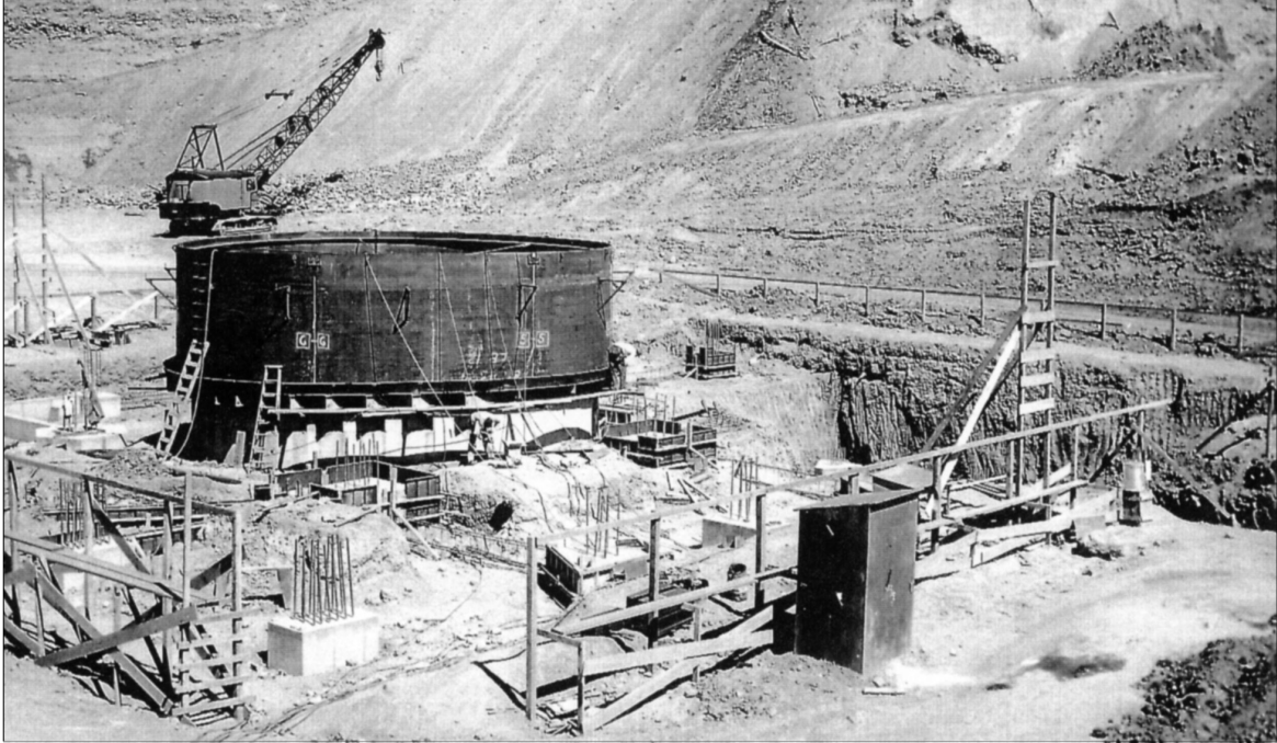
Figure 111. Furnace construction, Georgetown Canyon, 1957.